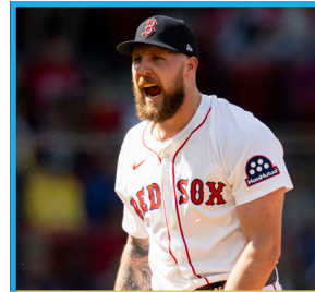
GARRETT CROCHET Boston Red Sox