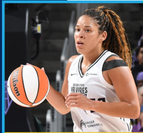
VERONICA BURTON WNBA