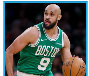
DERRICK WHITE Boston Celtics

PRESENTED BY THE SPORTS MUSEUM AND THE BOSTON SPORTS COMMUNITY